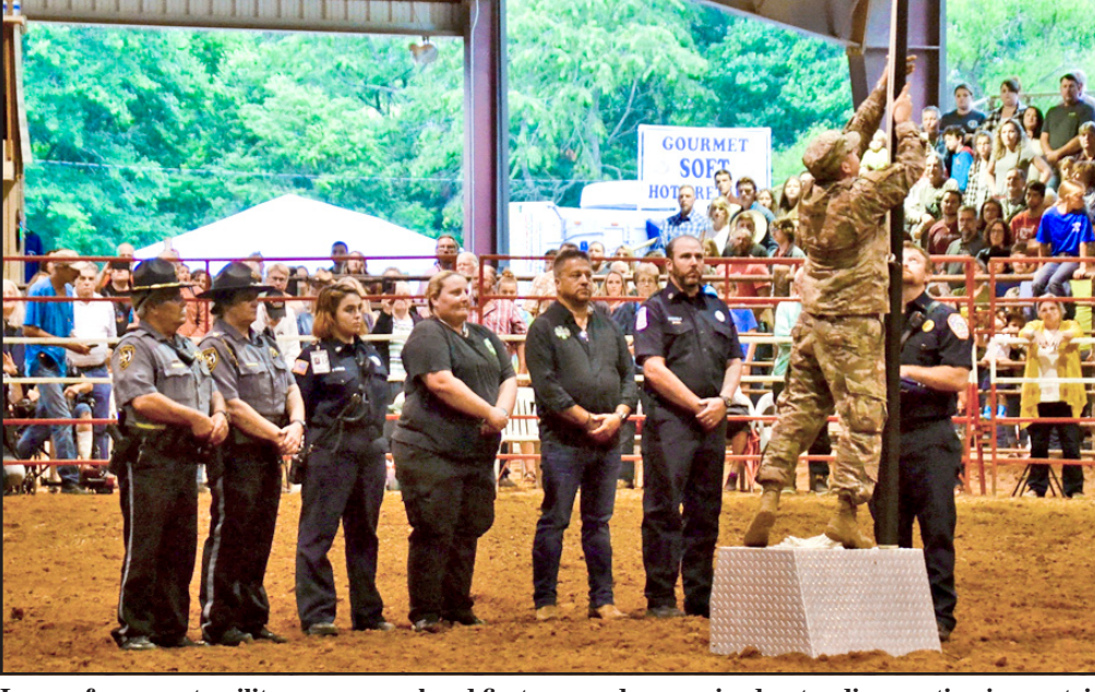
Law enforcement, military personnel and first responders received a standing ovation in a patriotic flag-raising ceremony each night of the Blairsville Pro Rodeo.

sponsor, the event took place over two nights, Friday, June 18, and Saturday, June 19.