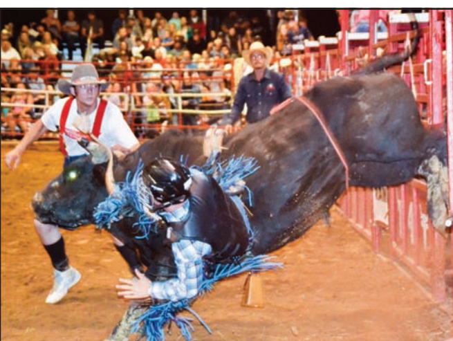
A bull tossing its rider on Saturday night during the main event of the packed-out Blairsville Pro Rodeo.

Presented by the Union County Saddle Club and Circle N Rodeo Production, with Mountain Valley Motors See Blairsville Pro Rodeo, Page 6A